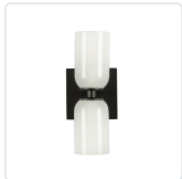
WS57712-BK/GO Black/Glossy Opal Glass