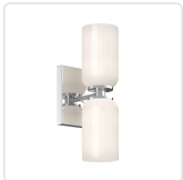
WS57712-CH/GO Chrome/Glossy Opal Glass