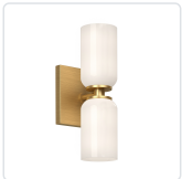
WS57712-BG/GO Brushed Gold/Glossy Opal Glass