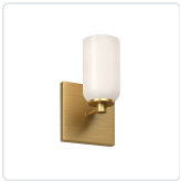
WS57704 Brushed Gold/Glossy Opal Glass