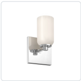
WS57704-CH/GO Chrome/Glossy Opal Glass