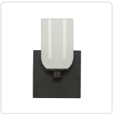
WS57704-BK/GO Black/Glossy Opal Glass